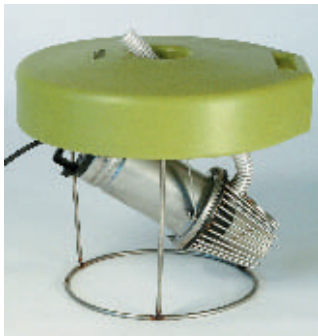
TURBO-JET 0.35 kW

Aqua-Handy , the handy, portable aerator, weighs only 12 kg and can be installed quickly and easily in the chosen place.